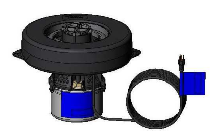
1400JF Without Lights