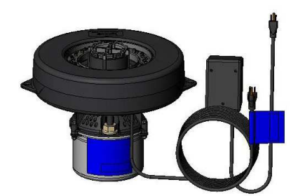
1400JFL With Lights

The motor unit attaches to the float using stainless steel hardware for a secure assembly. The single section, U.V. resistant, high density thermoplastic float allows for excellent durability with an attractive shape and low visibility. The rigid polypropylene fountain housing helps protect the unit from debris and reduce the likelihood of clogging.