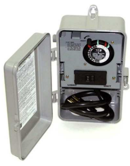
Each unit includes a UL Approved Control Panel complete with Class A Human Rated GFCI Protection, 24 Hour Mechanical Timer, and Photo Eye for Optional Light Kit. NEMA Type 3R weatherproof enclosure.