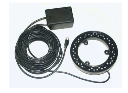
The Optional Lighting Package easily mounts to the float and can be purchased and added at any time. ETL approved.

Kasco Marine, Inc. 800 Deere Rd. Prescott, WI 54021